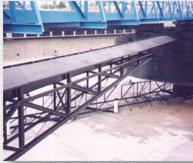
Full Radius Scum Trough and Skimmer